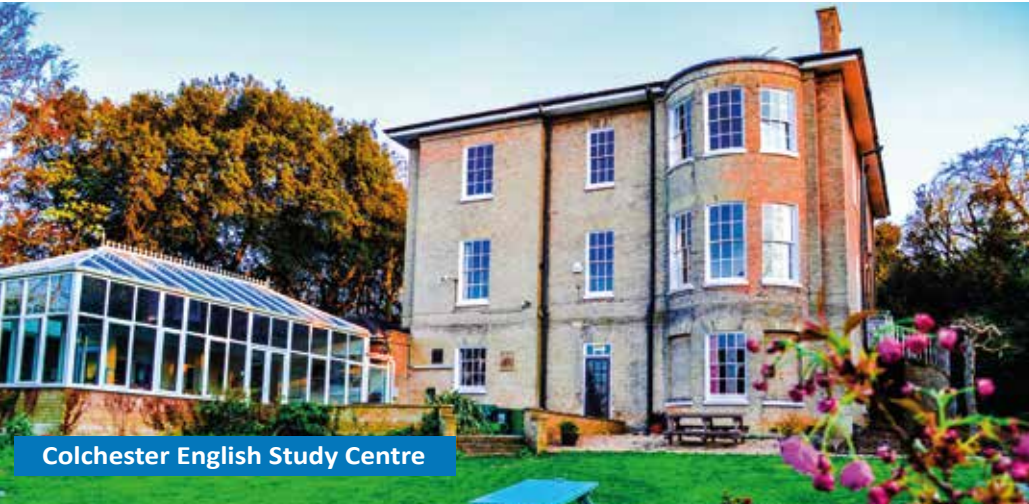
Colchester English Study Centre